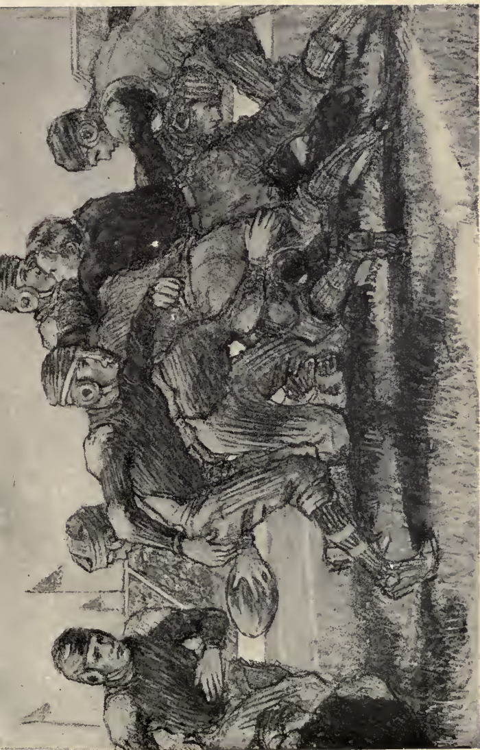
It was Alton's day all through